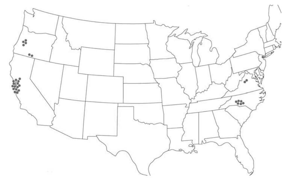
Figure 3. Geographical Distribution of MDMA in 1975–79 According to DEA Data (Seizures, Lab Raids, Street Buys and other Data) and PharmChem Data.

1978, Shulgin spoke about or published on MDMA on three occasions (Shulgin 1978; Shulgin, Braun, and Braun 1978; Anderson et al. 1978). Yet, in the broad picture, it looks more as if "MDMA had come across Shulgin" than Shulgin had come across MDMA.